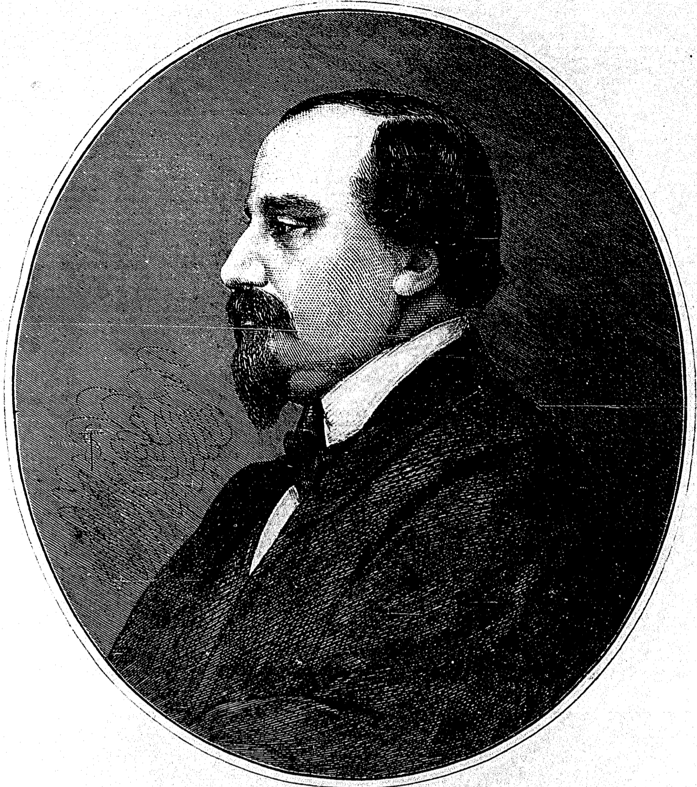
THE COMTE DE CHAMBORD.