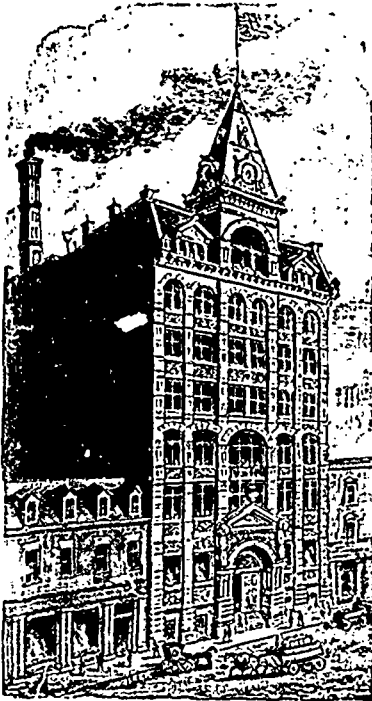
Our New Warehouse & Factory, Montreal (60,000 Square Feet of Floor Room)