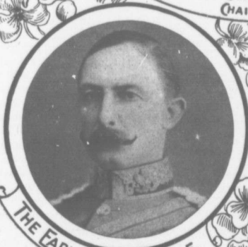
THE EARL OF ALBERMARLE.