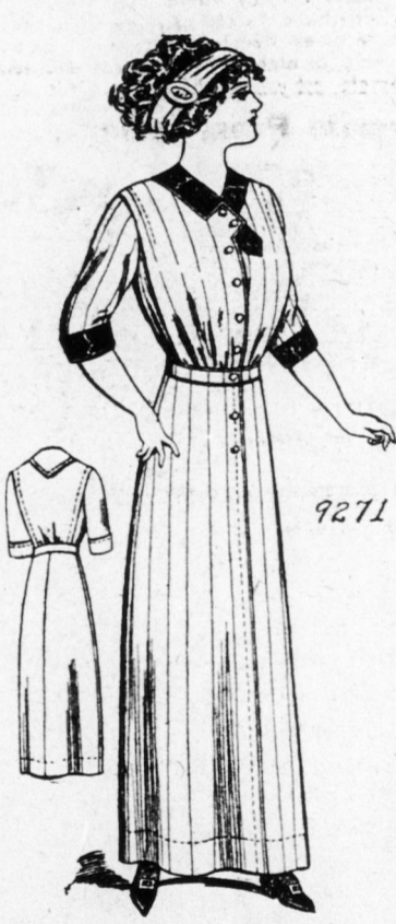
Ladies' House or Home Dress.

9271—A SIMPLE DRESS FOR HOUSE OR AFTERNOON WEAR