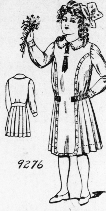
Girls' Dress with or without "Apron" Panel and with Front Closing.

A charming and becoming model is shown in this illustration. The front closing under the panel, which may be omitted, is particularly desirable on dresses for growing girls. The sleeve is on the bishop style finished with a band cuff. The Pattern is cut in 4 Sizes: 6, 8, 10, and 12 years. It requires 4 yards of 27 inch material for the 8 year size.