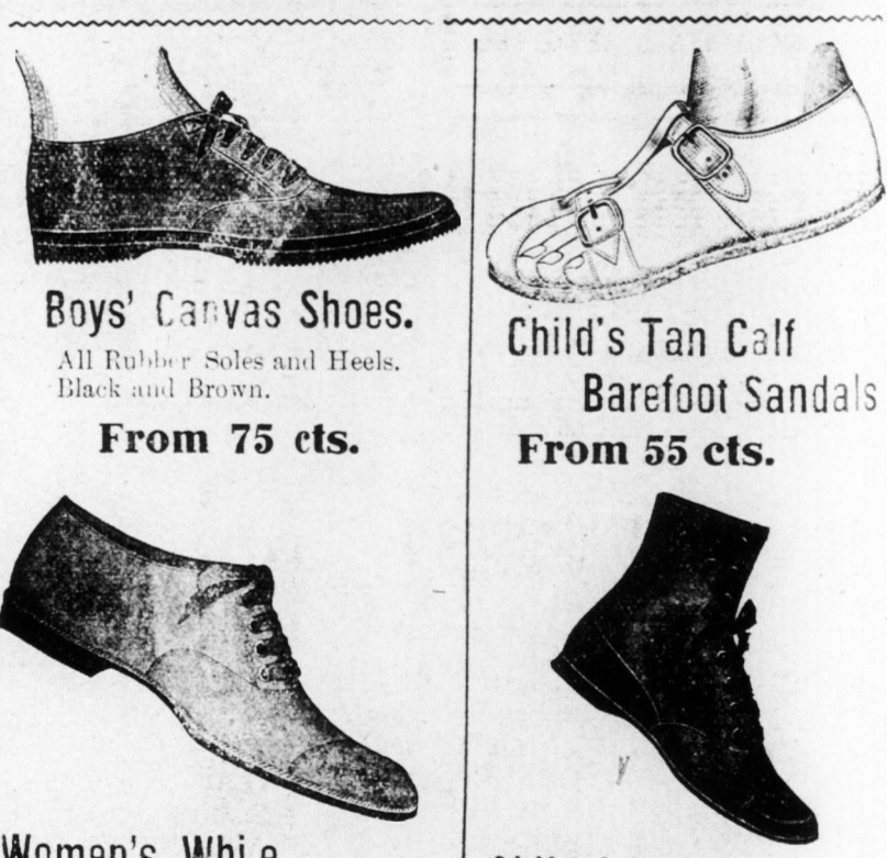
Boys' Canvas Shoes. All Rubber Soles and Heels. Black and Brown. From 75 cts.