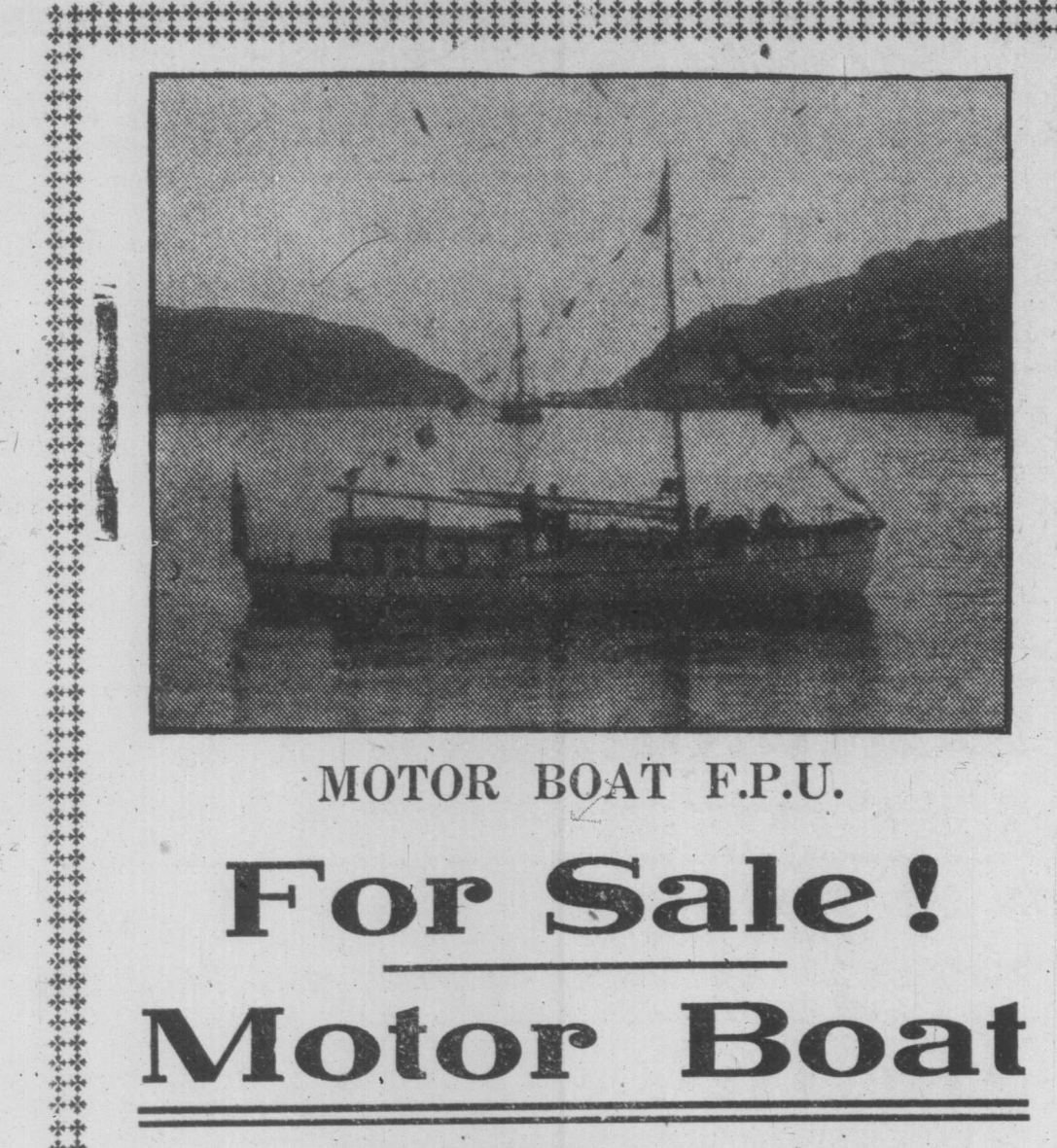
MOTOR BOAT F.P.U.