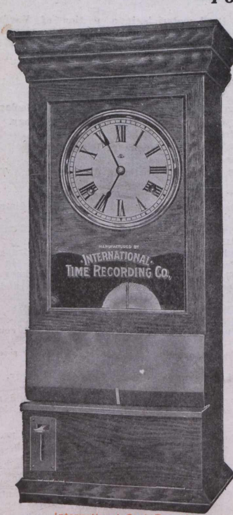
International Cost Recorder MADE IN CANADA.

(Also makers of Dayton Computing Scales and Hollerith Electric Tabulators)