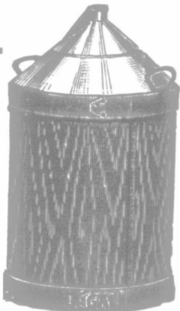
High-grade Cylinder Oil fully guaranteed

before placing your order for supplies for the coming season send for our new catalogue. We can save you money on everything.