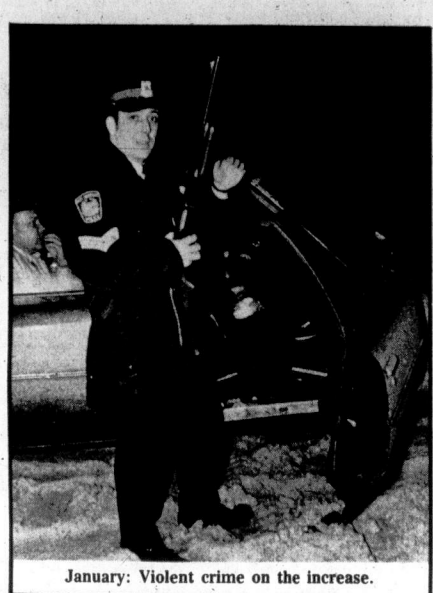
January: Violent crime on the increase.