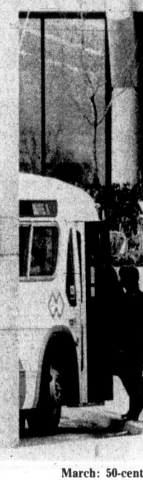
March: 50-cent bus fares approved.

Peel Board of Education has finally approved $120