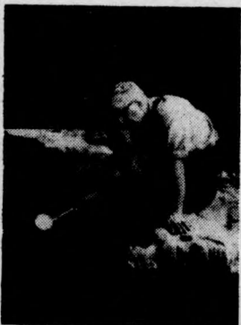
Our own iron-free water

AT THE JACK DANIEL DISTILLERY, we have everything we need to make our whiskey uncommonly smooth.