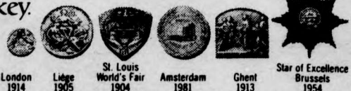
London 1914, Liège 1905, St. Louis World's Fair 1904, Amsterdam 1901, Ghent 1913, Star of Excellence Brussels 1954

We have daily deliveries of the very finest grain American farmers can grow. A stream of pure, iron-free water (ideal for whiskey-making) flowing close by our door. And a unique way of smoothing out whiskey by filtering it for days through ten feet of finely-packed charcoal. Thanks to all these things—and some others too—we predict a pleasurable moment when you discover the smooth-sippin' rareness of Jack Daniel's Tennessee Whiskey.