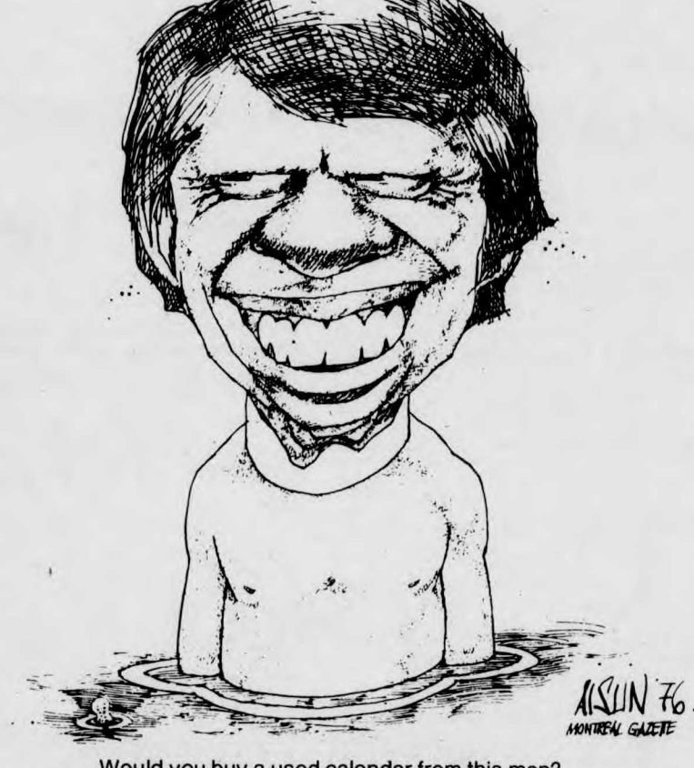
Would you buy a used calendar from this man?