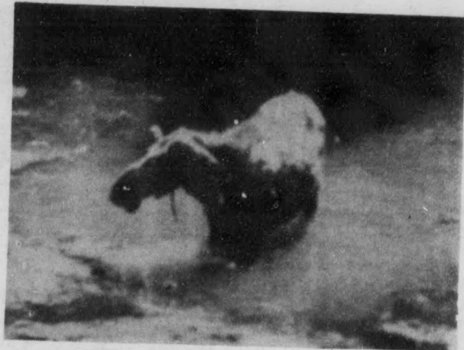
Will this moose, grazing here in a pond in the Kenai Mosse Range, be a victim of the pipeline?

Polar Gas has already had meetings with potential producers in the Delta and also with Dome Petroleum, the operation in the Beaufort Sea.