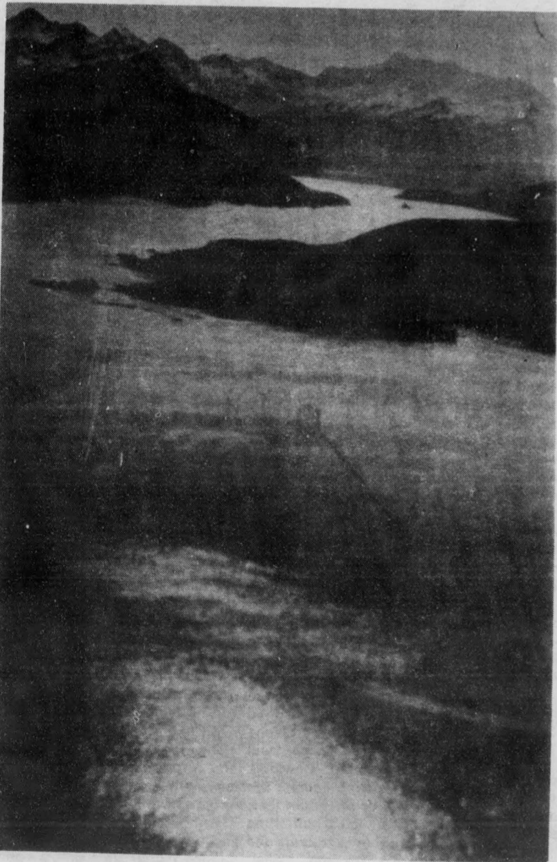
The straits from Prince William Sound into Valdez Arm. It is here where tankers will join up with the southern terminal of the Trans Alaska Pipeline

What does all this lead to? Although at first it may appear that a large number of companies are involved, there are, in fact, only a handful. Is the solution to export the abundance of gas in the west and pipe down from the North the gas that is needed to replace the exported gas? This is a question that will require a lot of deliberation before it can be properly answered.