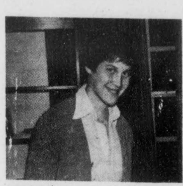
th Pres 1½

I didn't make any but I quit I resolved to get a haircut.