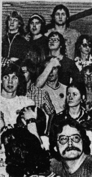
With the end of the seventies came an end to an almost oppressive apathy amongst the student body. It is time to stop laughing at danger! It is time to seriously re-evaluate our role as students, citizens and even people of the world.