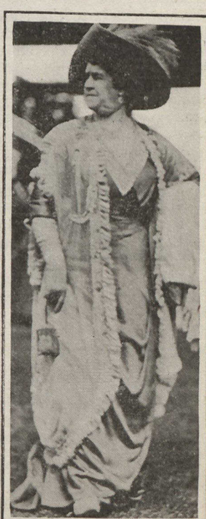
Another View of a Charming Diaphanous Wrap.