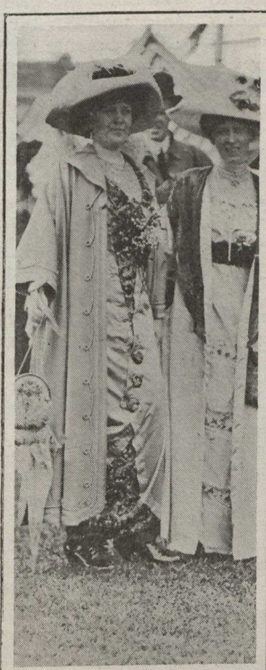
Rich Gowns Peeped from Enveloping Wraps.