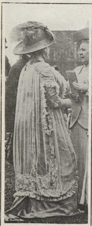
Passementerie and Chiffon Composed This Mantle.