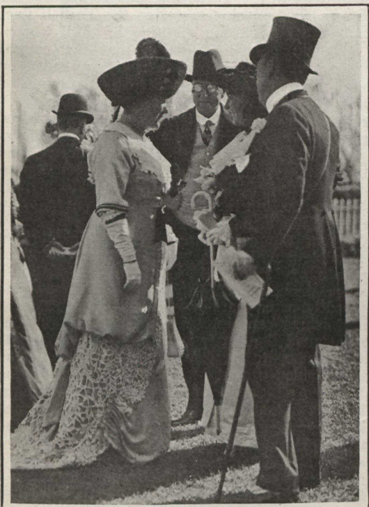
An Elegant Compromise with the Pannier.