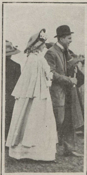
The Rembrandt Hat A-top Appropriate Quaintness.