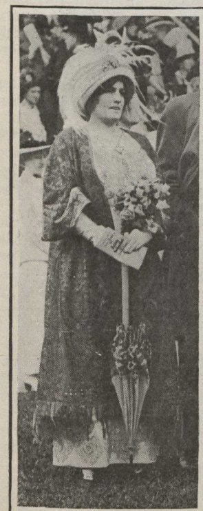
A Cloak that Hinted the Influence of the Durbar.