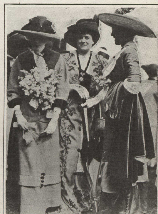
Exotics, Real and Embroidered, Lent Their Charm