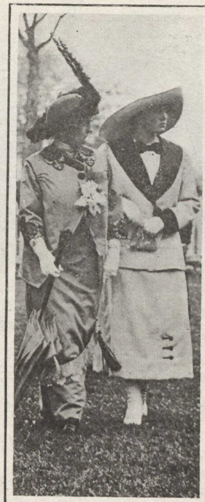
Tailor-mades Contributed Much Trigness.

ILLUSTRATING TORONTO'S ANNUAL FASHION FETE AT THE WOOD-BINE. FANFARE AND COLOUR WERE THE ORDER IN SPIRITS AND COSTUME