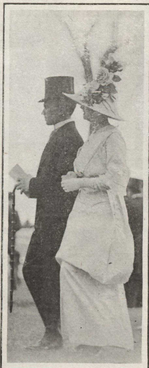
An Injudicious Wind Over-Blowled a Panniered Skirt.

ILLUSTRATING TORONTO'S ANNUAL FASHION FETE AT THE WOOD-BINE. FANFARE AND COLOUR WERE THE ORDER IN SPIRITS AND COSTUME