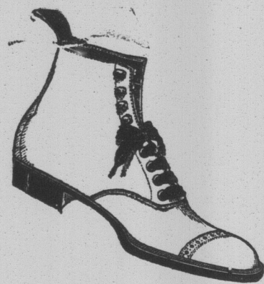
The place for Shoes and Rubberwear

We know what you want, you want shoes without wings, shoes without machinery, plain shoes, stylish shoes, strong to wear, comfort for your feet, easy on your purse.