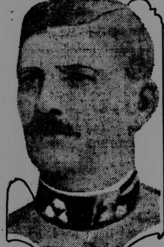
Gen. Rudolf von Brudermann, commander of the army of the north.