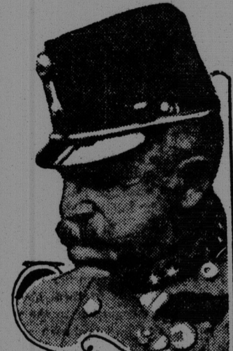
Arch Duke Frederick, commander-in-chief.