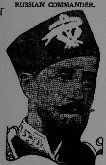
Gen. Nikolai Nikolayewitch, chief of the Russian army.