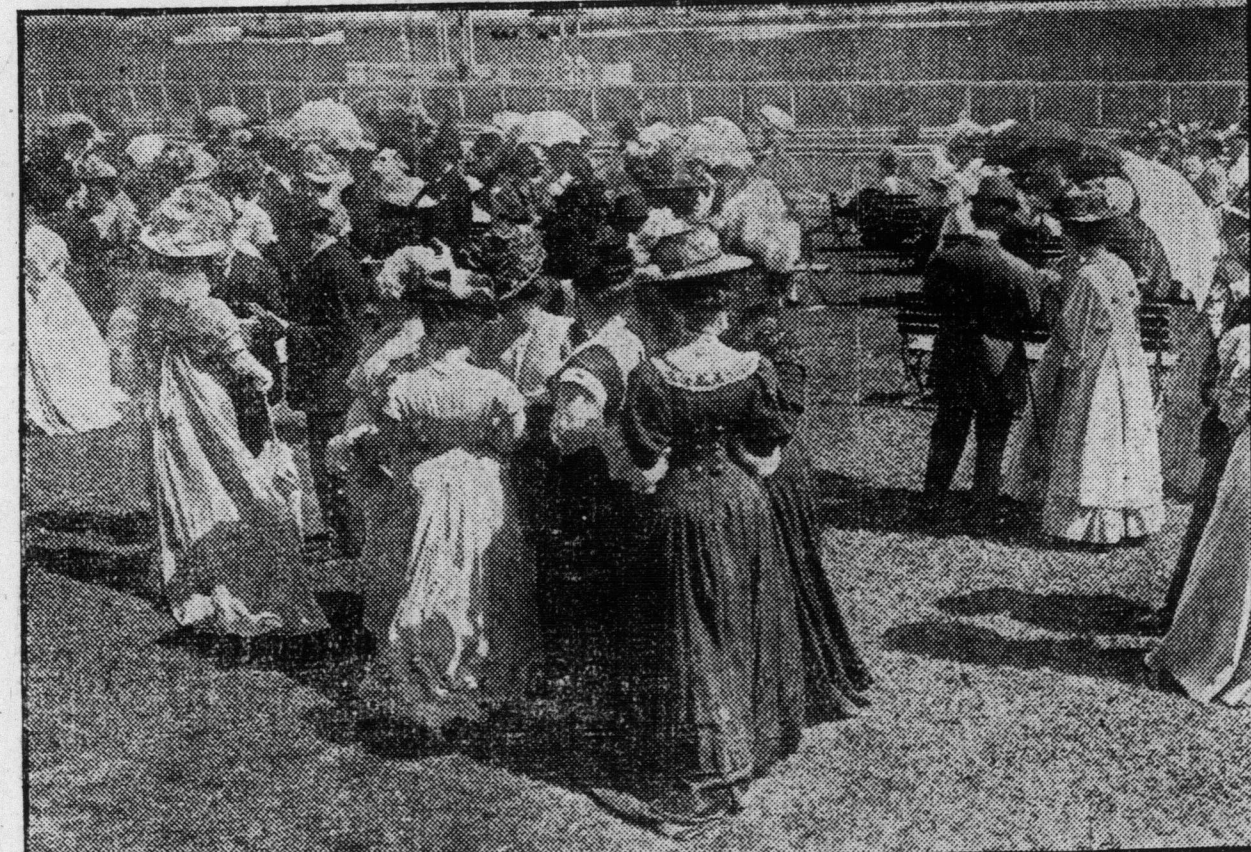
ON THE LAWN AT WOODBINE Where many of the fairest of Toronto's fair women congregated yesterday.

Donlands Maple Syrup, only eighty odd bottles left, at Fifty Cents a bottle, to close out. At Michie's.