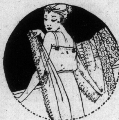
—Main Floor, Yonge St.

Embroidered Bretonne net, in 27 and 40-inch width, in black only, finished with scalloped, also plain edge for hemming; a splendid quality for waists and dresses. Special, yard ..... 38