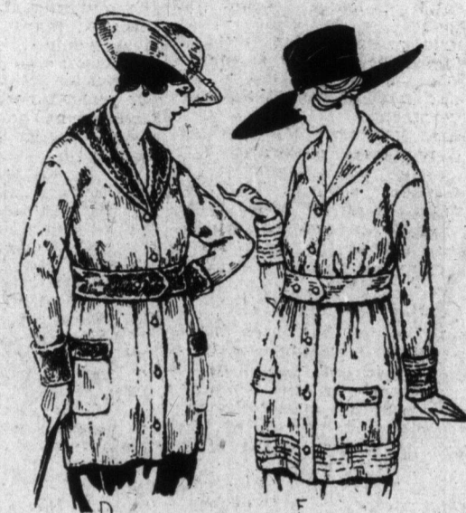
—Third Floor, Centre.

The colors include rose with brown, white, Oxford or black collars and trimmings, cherry and white, Copen. and white, maize and white, mauve and white, emerald, coral, etc. Though the collection is large, the number in some styles is limited. So come early for a good choice. Extra space and salespeople will make selection easy. Special ..... 6.95