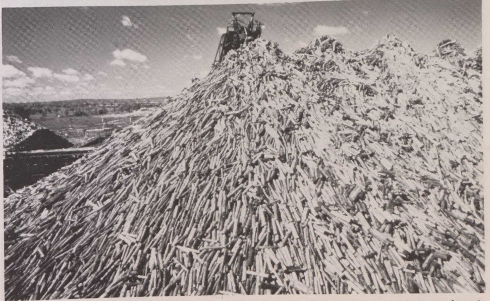
Canada's vast renewable forest resources supply the pulpwood for the industry's pulp and paper mills. The huge woodpile shown in the foreground might be sufficient to feed a large mill for a couple of months.

During the first quarter of 1982, Canada produced 4.76-million tonnes of paper pulp. More than 65 per cent of this