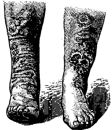
AS THEY WERE