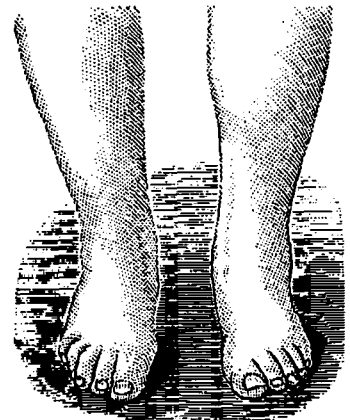
As they are after four weeks' treatment.