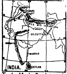
Trade Mark Registered