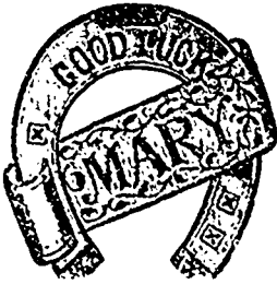
Solid Silver. Gold Trimming.