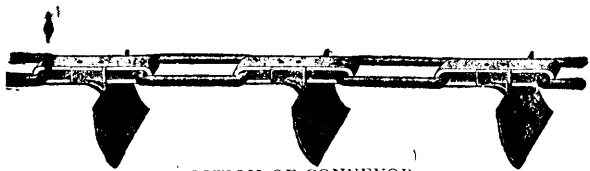
SECTION OF CONVEYOR.