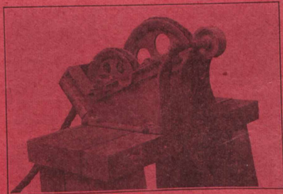
'Perfect' Piledriver Headblocks

ALSO WIRE ROPE AND FITTINGS, MANILA ROPE, BLOCKS.