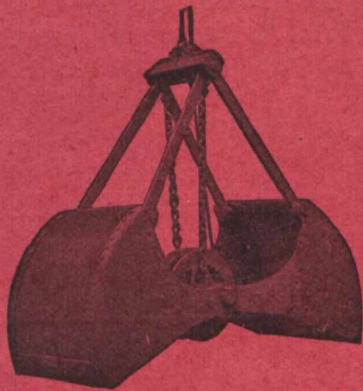
Buckets (Clam Shell, Orange Peel Concrete, etc.)