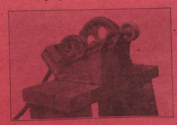
Perfect" Piledriver Headblocks

ALSO WIRE ROPE AND FITTINGS, MANILA ROPE, BLOCKS.