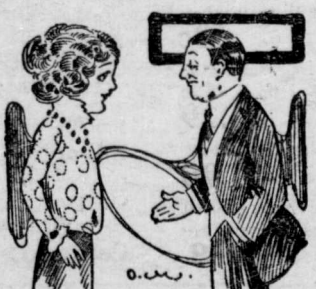
Honeymoon Still On.

And I feel sure that we were both correct.