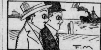
The Preliminary Step.

To guard the baby against colds nothing can equal Baby's Own Tablets. The Tablets are a mild laxative that will keep the little one's stomach and bowels working regularly. It is a recognized fact that where the stomach and bowels are in good order that colds will not exist; that the health of the little one will be good; and that he will thrive and be happy. The new sales tax will not increase the price of Baby's Own Tablets, as the company pays the tax. You can still obtain Tablets through any medicine dealer at 25 cents a box, or by mail, post paid, from The Dr. Williams' Medicine Co., Brockville, Ont.