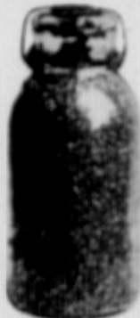
This is a photograph of the actual bottle of wheat after it had been weighed and sealed. The car shows it very much reduced in size.

Everyone who sends in a year's subscription for the Canadian Thresherman and Farmer, either new or renewal, is entitled to estimates as explained. These estimates may be credited in whatever way desired, and you may send in as many estimates as you wish. Remember every additional estimate increases your chance to win the automobile. Estimate early and increase your chance of winning for it is the best one that estimates nearest to the number of whole kernels that wins the car. Don't be afraid to try. One kernel if only win you the grand prize. For further particulars see April 12th issue of this paper, or write to the E. H. Heath Co. Ltd., Winnipeg.