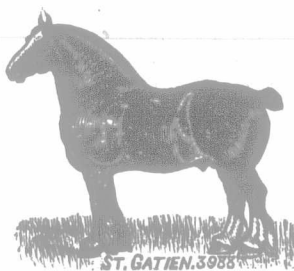
ST. GATIE. 3985

Prices Reasonable. Catalogues Furnished on Application.