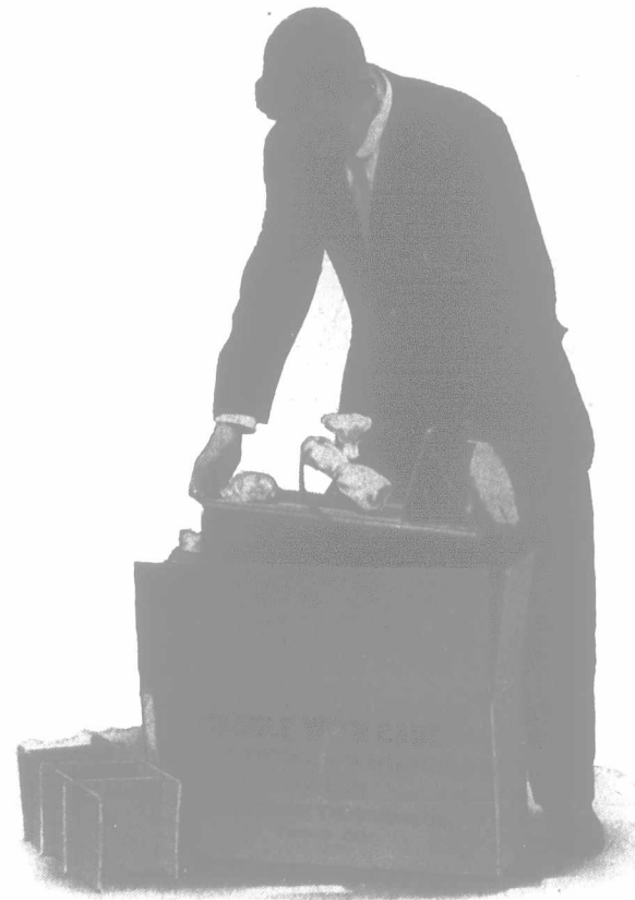
Packed in most up-to-date style. Every telephone in separate case, as shown. Note that the transmitter, receiver and shelf are attached ready for service.

If construction materials are required in a hurry, we can supply them promptly. We carry a large stock of all kinds, and handle nothing but first grade. Write for Price List.