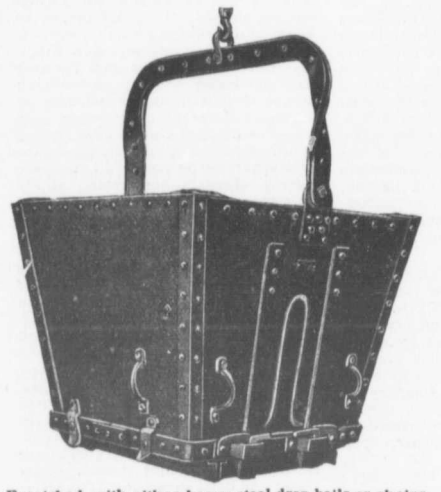
Furnished with either heavy steel drop bails or chains