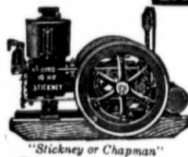
"Stickney or Chapman"