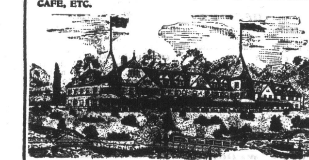
Grande Pointe Hotel, on River St. Clair, 35 miles north of Detroit.

NEW OWNERSHIP, NEW MANAGEMENT, ENLARGED DOUBLE FORMER CAPACITY, 125 ROOMS, MANY WITH PRIVATE BATH ROOMS, BOWLING ALLEYS, BILLIARDS, BALL ROOM, CAFE, ETC.