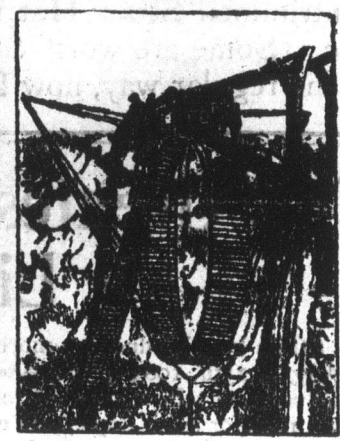
"HOOPING THE HOOP" IN AN AUTO.

The feat is called "hooping the hoop" and is the invention of Eddie Gifford, the one-legged cyclist. The principal difference between Miss