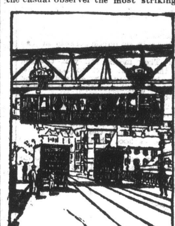
SUSPENDED RAILWAY PASSING OVER A STREET AT RIGHT ANGLES.

The road, which is already in experimental operation, connects the towns of Barmen, Elberfeld and Vohwinkel and for a great part of the way runs over the river Wupper. To the casual observer the most striking