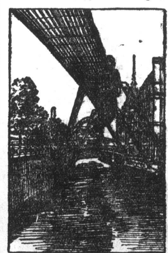
SECTION OF SUSPENDED RAILWAY OVER THE RIVER WUPPER.

The main objection to the suspended railway is its rather unattractive appearance, but the German structure, painted a delicate shade of blue, presents a very light appearance. It would appear much lighter