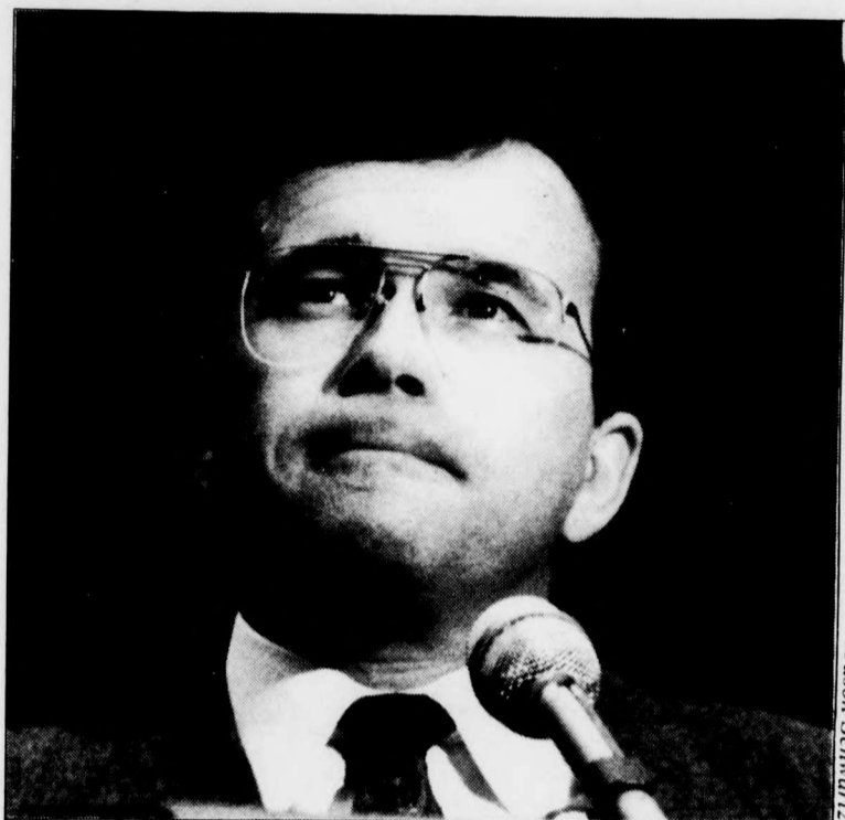
Manitoba Premier Gary Filmon speaking at Osgoode.