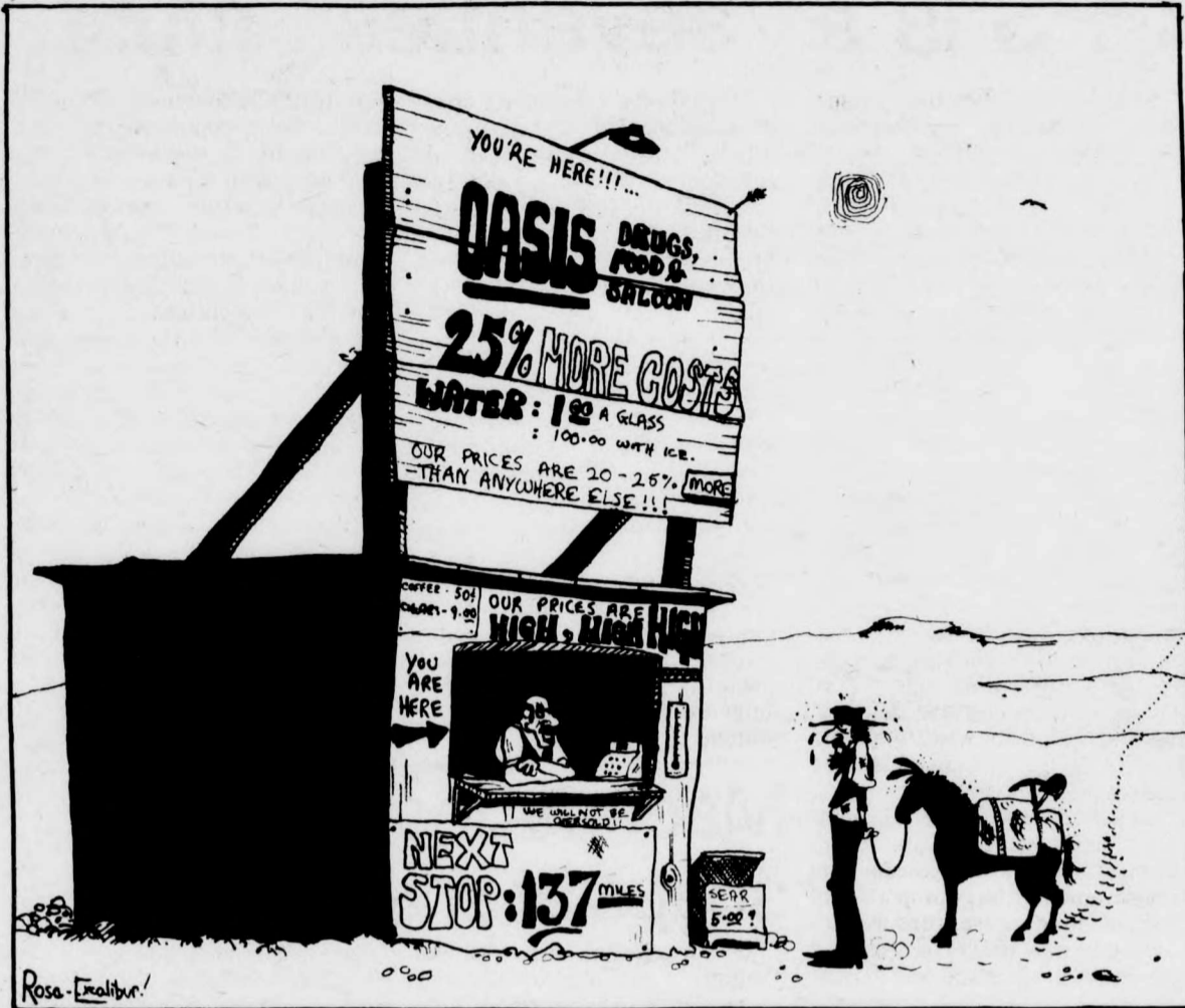
"So what's your problem? You can go to another store if you don't like our prices."