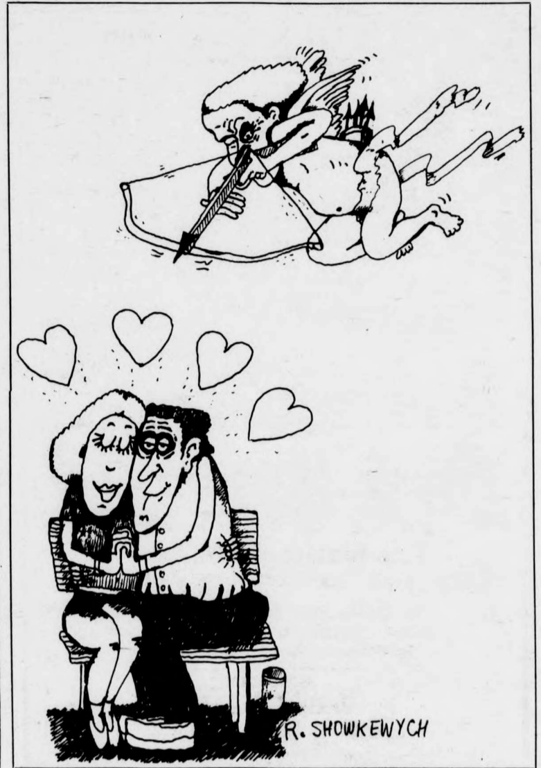
Happy Valentine's Day