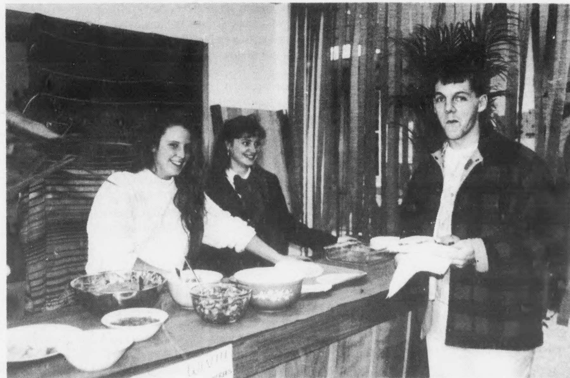
"Oasis For Health" -- Students in d'Avery Hall were presented with information on their eating habits on Tuesday, November 10.

The skills acquired from the practice of parliamentary debate are invaluable. Through the use of logic and reasoning, debaters learn how to use constructive argument as a tool for conflict resolution. Many employers today favour candidates with experience in debating, for their ability to engage in logical argument and their power to persuade. Anyone interested in joining the Debating Union can come to one of our weekly meetings in Tilley 303 at 6:30 on Tuesdays.