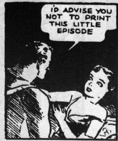
Captain Gateway gives sage editorial advice to a new

The Adventures of Captain Gateway Libby-Francophone Publishing