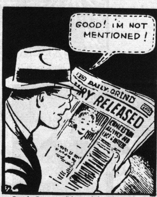
Captain Gateway relishes verbal warfare with any opposition