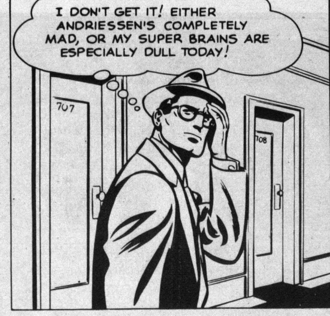
Captain Gateway: the introspective superhero