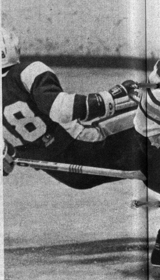
"The new players on the team are easily the best roup

now in the NHL. There's guys from every com