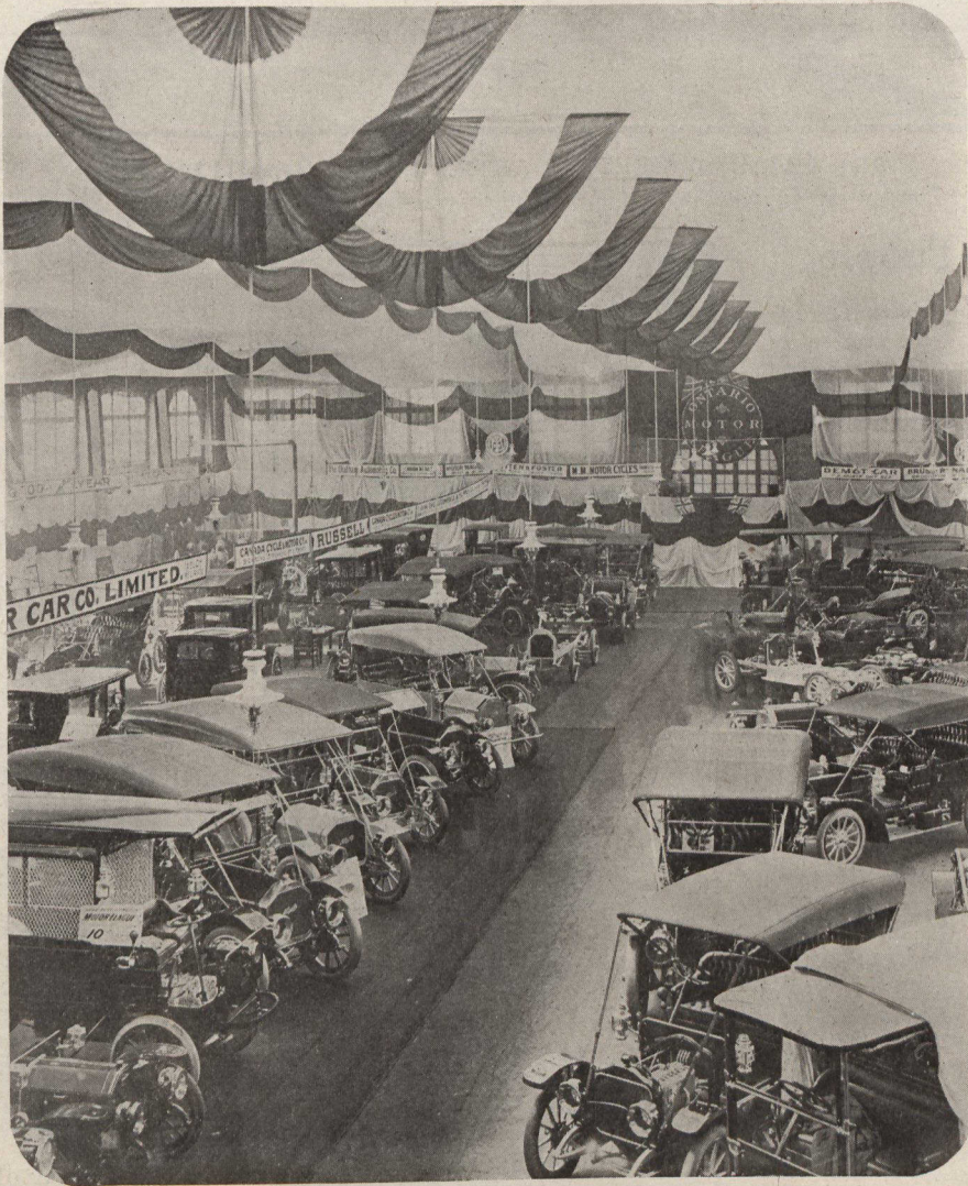
General View of the Motor Show now being held in Toronto, under the auspices of the Ontario Motor League.

The Canadian factory will always have the advantage of being able to study the Canadian climatic conditions and tastes at first hand. Moreover, there is a sentiment among Canadians that, other things being equal, they would prefer to ride in a Canadian-made car. Of course, where they want an expensive car and are willing to pay a high price they are certain to patronise the best makers