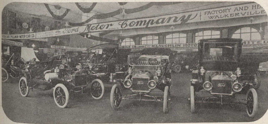
A variety shown by the Ford Motor Co., Walkerville.