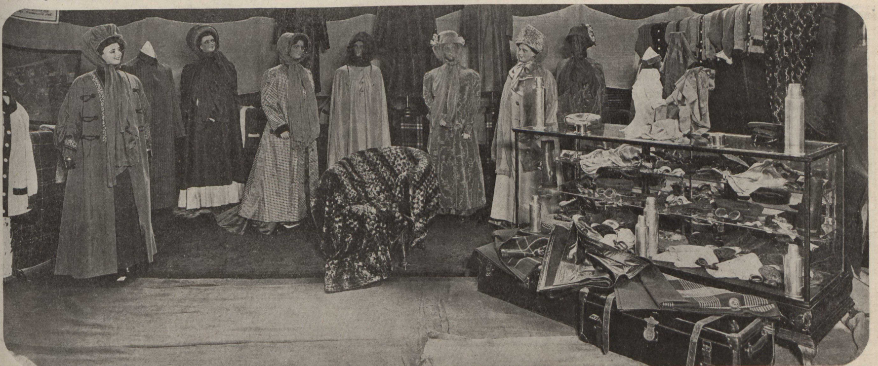
The Latest in Motor Clothing, the exhibit of the T. Eaton Co.

Among the Canadian firms exhibiting at the present show the following may be mentioned: The Canada Cycle and Motor Co., which may be termed the pioneer Canadian company; the Ford Motor Co., which has been manufacturing for some years in Walkerville; the Reo Motor Co. of St. Catharines; the McLaughlin Motor Car Co. of Oshawa, makers of the McLaughlin-Buick car; also the Hupmobile Motor Co. of Detroit, which is now establishing a branch factory at Windsor; and the E. M. F. Motor Company at Walkerville. Of all the companies the Canada Cycle and Motor with their famous Russell car are doing the most to show to the world that Canadian brains and mechanical skill are unexcelled under fair competitive conditions.