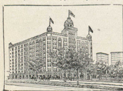
IN THE VERY CENTRE OF EVERYTHING. All surface cars pass or transfer to door. Subway and "L" stations, two minutes.

For Families and Transients Broadway and 63d Street, (Lincoln Square) N. Y. CITY