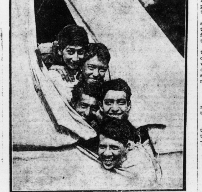
Members of the 1st Bombay Troop of Boy Scouts, who arrived in England for the big Jamboree, are shown enjoying a joke at their camp at Sidecup.

Canada produces 88 per cent. of the world's asbestos supply all from the mines of southern Quebec.