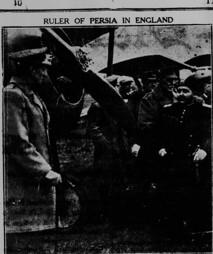
The Shah interested in one of the aeroplanes which he inspected at Farnboro.