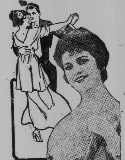
A Lovely Complexion Lends Life and Vivacity to All Occasions

There are scientific reasons why the calcium wafers in Stuart's Calcium Wafers is a most wonderful skin beautifier. It works in the blood, enriches it, purifies it, gives to the skin a power to convert impurities into a harmless substance that is carried off invisibly. But best of all is the host of pretty girls and matrons who have rid their complexions of pimples, boils, eczema, acne, and other eruptions by simply using Stuart's Calcium Wafers. You will find them on sale at almost every drug store in the U. S. or Canada at 50 cents a box. Get a box today or send the coupon below for a free trial package.