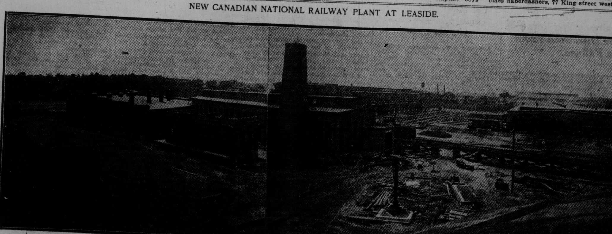
View of the Canadian National Railways' locomotive and car repair plant at Leaside, five miles from Toronto Union Station, and which is expected to be opened shortly. This picture is tower, and other minor structures, do not appear in this picture, The necessary machinery is being installed. This plant is intended to handle all repair work over lines between