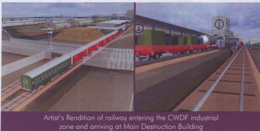
Artist's Rendition of railway entering the CWDF industrial zone and arriving at Main Destruction Building