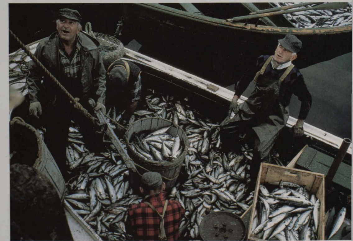
S.S.C. Photo Centre, Bryce Flynn