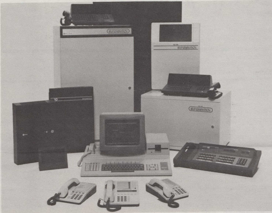
Mitel Corporation will display a wide range of products at Telecom 83, from sets to systems, to management workstations.

through an international competition, as the prime contractor to provide two communications satellites to the government of Brazil for their domestic satellite system. This $150-million contract includes the ground control stations.