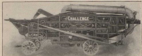
The WHITE CHALLENGER with Wind Stacker.

HAS OUR 1905 CIRCULAR REACHED YOU? FULL OF GOOD THINGS.