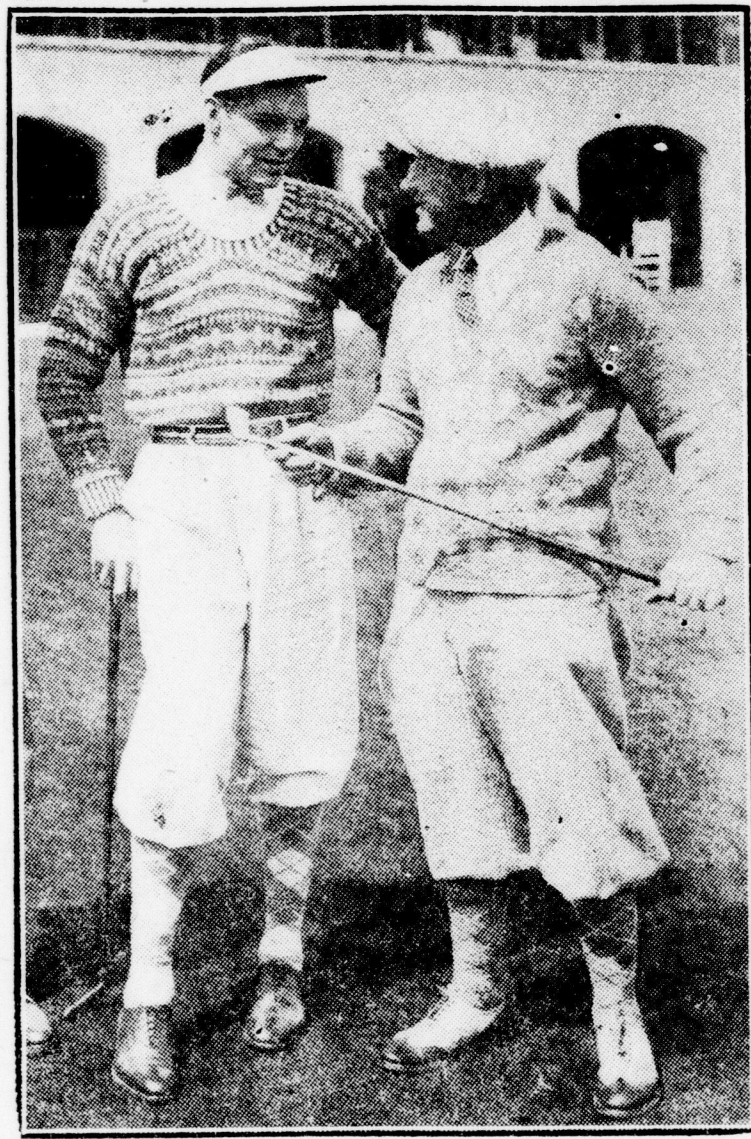
NOW HE'S PLAYING GOLF.