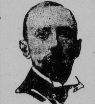
CAPT. ROALD AMUNDSEN

straight south through Ross sea to McMurdo sound, near which he established his winter quarters last May. All summer — winter, down there — Scott's party awaited the coming of November — of summer — when the journey over ice and snow was begun; through the most fearful storms that rage anywhere on earth the explorers went. If they followed the schedule planned by Capt. Scott, he with four picked men, left the party at the beginning of December for the last mad dash for the pole, hoping to reach it Dec. 25, which corresponds to the northern June 25, when the sun lasts the longest and it is the warmest.