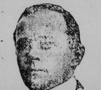
CAPT. R. F. SCOTT

(Publishers Press News Service) London. — Did either Capt. Scott or Capt. Amundsen reach the South Pole on Xmas day in the principal topic in London at the present moment.