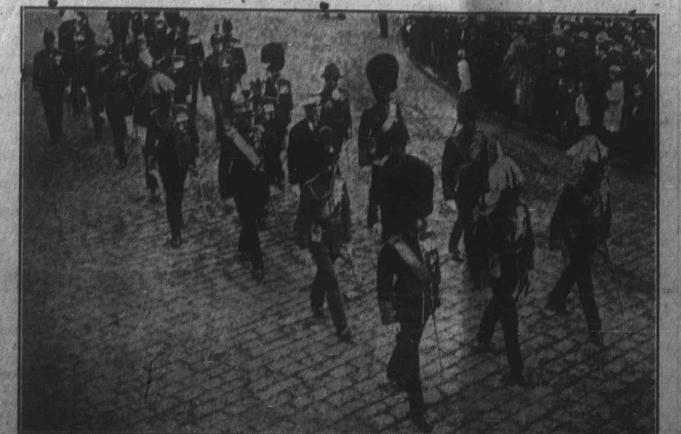
The photograph shows the principal mourners who followed behind the flag-covered gun carriage. In the front row from left to right—The Marquis of Carisbrooke, The King, and The Duke of Connaught. 2nd Row: The Duke of York, The Marquis of Milford Haven, and Prince Henry. 3rd Row: Prince George (in centre) and Viscount Lascelles on the right.